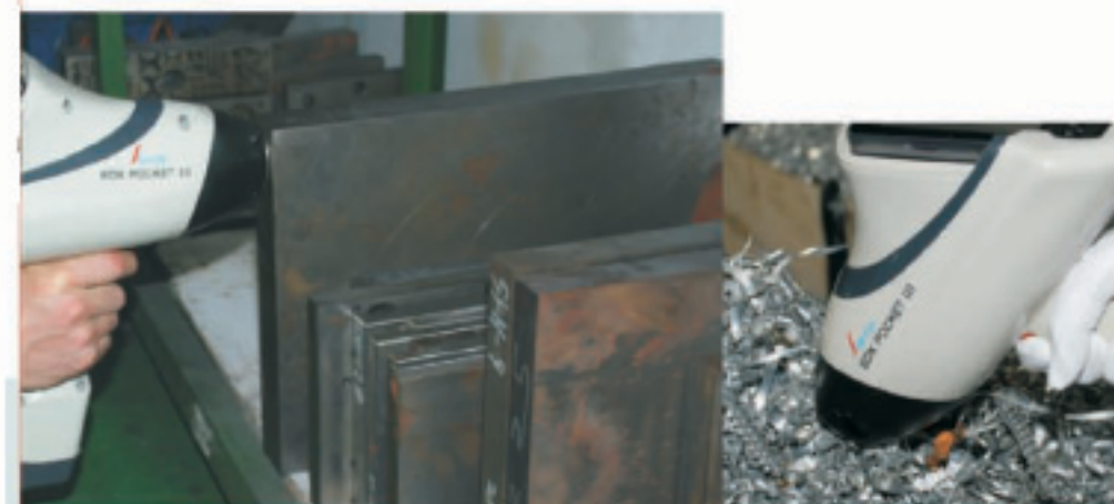
▲ Overstock steels recycling in warehouses

Skyray EDX Pocket III Handheld X-ray Fluorescence Spectrometer is designed for on-site measurement and rapid sorting of volume scrap metals. It allows the scrap dealers to make rapid and reliable judgment on the raw material deals. As a powerful weapon used for metal identification in scrap and regeneration metals recycling, it has contributed significantly to the development of renewable material industry.