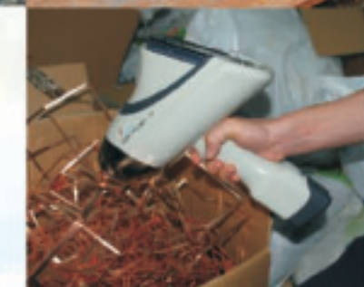
▲ Test of cutting scraps or shavings